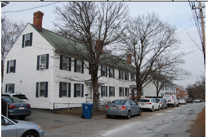
View looking north along Gay St. 21-27 Gay Street at L.