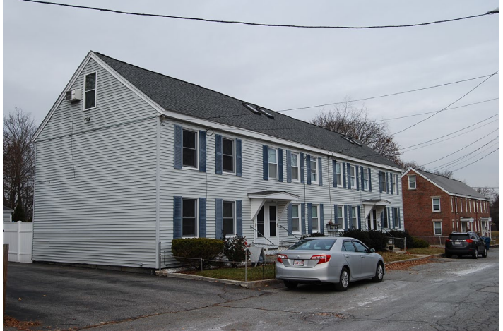
View looking north at 11-17 Gay St (L) and 1-7 Gay St (R)