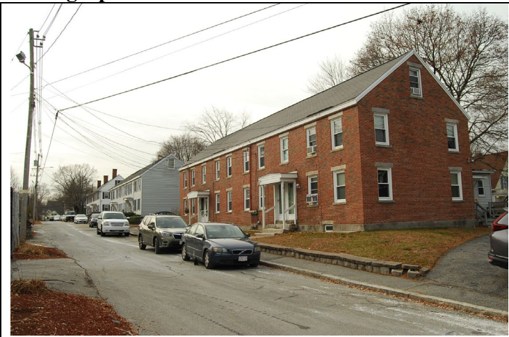
View looking southwest along Gay Street from the intersection with Middlesex St. 1-7 Gay Street at right.