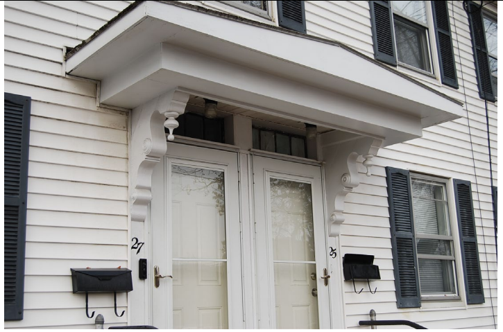
Detail. Entrance of 21-27 Gay St.