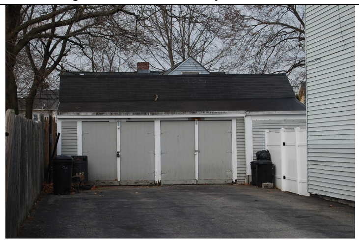
Garage. 11-17 Gay St.