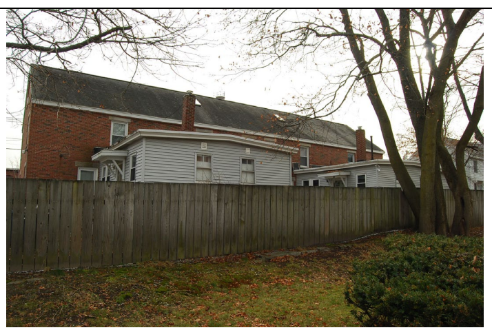
View looking south at rear of 1-7 Gay St.